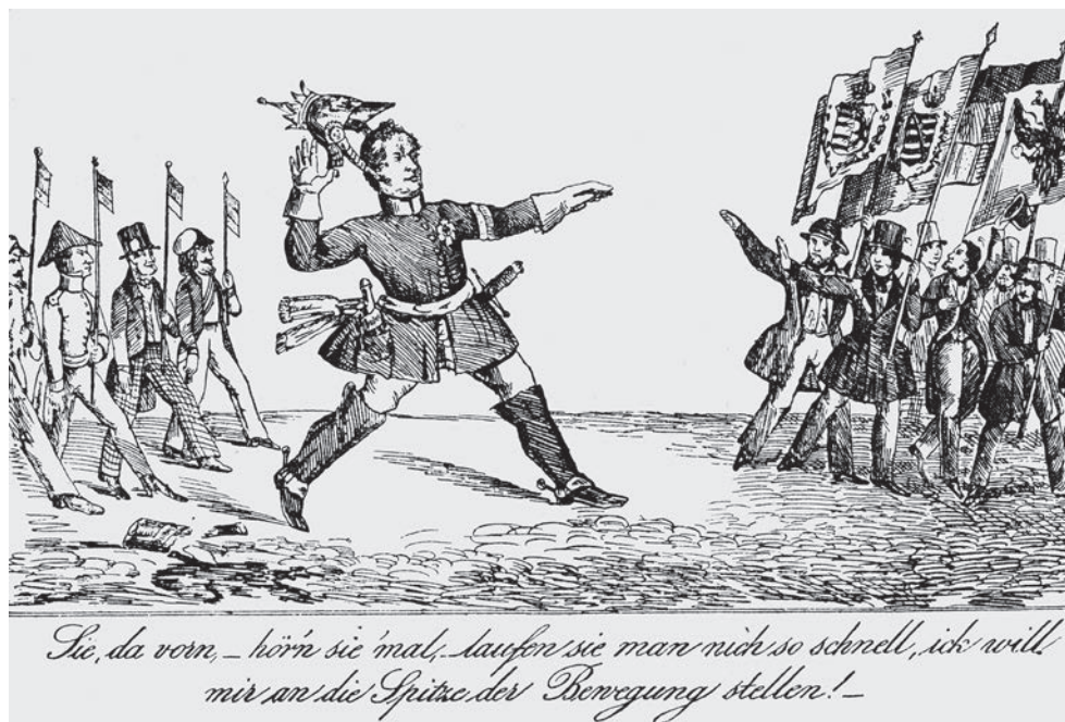
A German cartoon published in March 1848. Frederick William IV calls to the revolutionaries, 'You up ahead! Run to me because I want to spearhead [lead] the movement.'